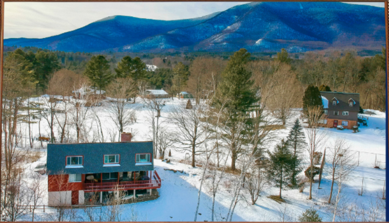
Manchester Village Vermont